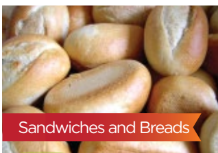
Sandwiches and Breads

Presentation: package x 510 grs. package x 560 grs. Portion: 63,75 grs. Performance: 8 portions