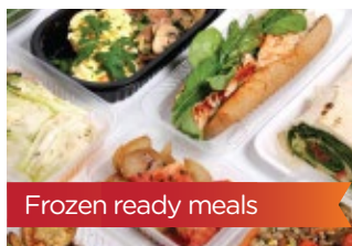
Frozen ready meals

Presentation: package x 200 grs. Performance: 1 portion